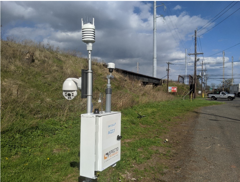
PTZ Camera/Weather Station