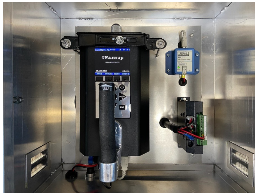
Mercury Vapor Analyser