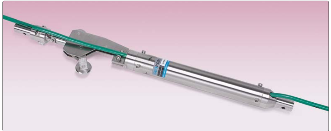
• 6150F Series Biaxial MEMS Tilt Sensor.