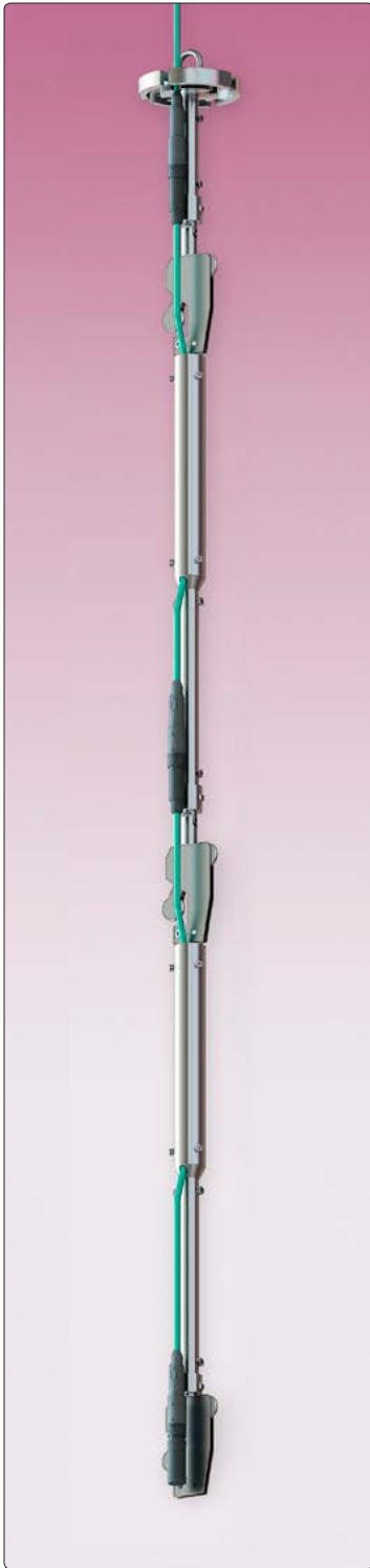
● Model 6150F MEMS In-Place Inclinometer.