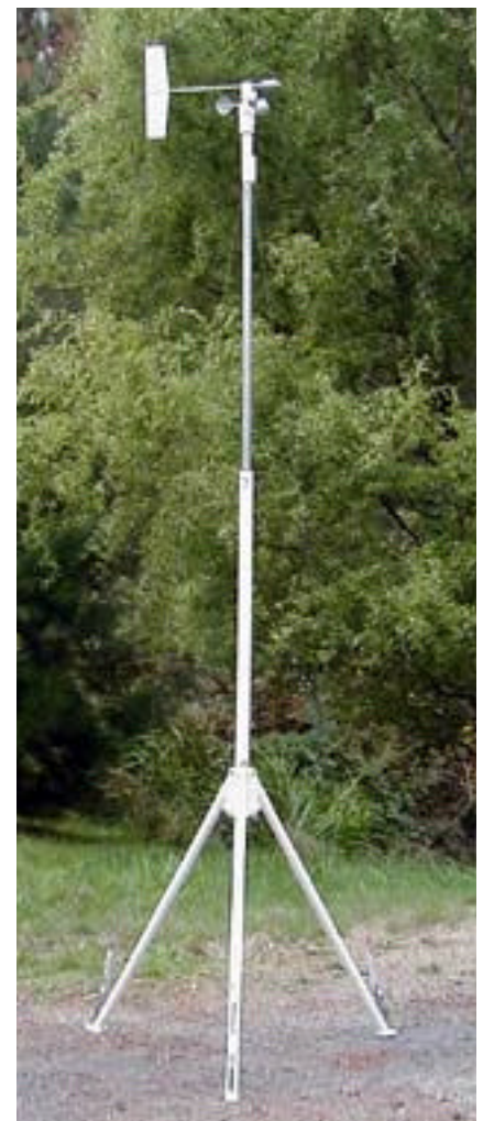
905 Tripod in Extended Position