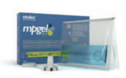
bags in 4 sizes