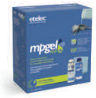
bottles in 2 sizes