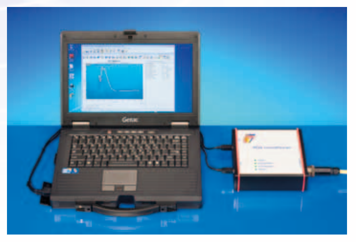
The PDA-USB conditioner allows for optimum flexibility in the choice of a rugged notebook.

The Profound PDA-USB conditioner directly processes the signals from the sensors and immediately shows a variety of results from the velocity and force signals obtained for each hammer blow on the screen of the notebook. A selection of the available graphs, all presented as a function of time and scaled in SI units, include: force and velocity x impedance, downward and upward travelling waves, transferred energy, driving resistance and the estimated static resistance. In addition other important parameters such as maximum compression and tension stresses in the pile, shaft friction and toe resistance can be shown as a function of blow number or penetration.