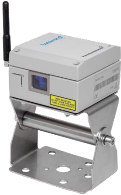
Fig. 5: LaserTilt90 on a swivel mounting bracket LS-ACC-LAS-SB attached to a WS-ACC-LAS-NSB-ADAP to be installed with a convergence bolt G3/8" male thread.