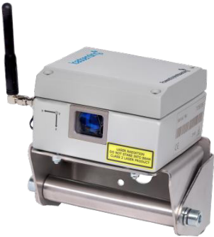
Fig. 3: LaserTilt90 mounted on a swivel mounting bracket WS-ACC-LAS-NSB on a vertical surface.