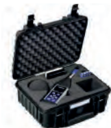
SA 72 Waterproof carrying case