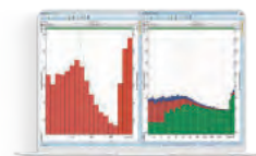
SF 971A_P1 Package 1/1 & 1/3 octave and audio recording