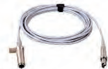
SC 91A Microphone Extension Cable