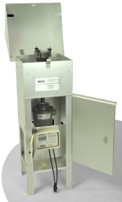
TO-13A PUF Sampling for SVOCs (PAHs)

We highly recommend engaging the services of an ambient air quality professional to guide the selection of appropriate sampling methodologies and for the training of field staff.