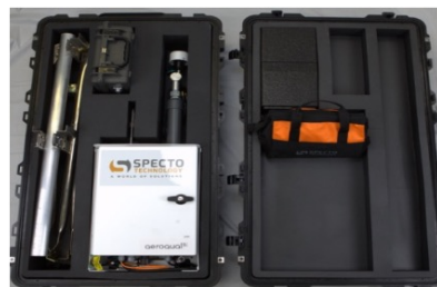
Real-time Perimeter Monitor (VOCs, “PM10” and Weather)