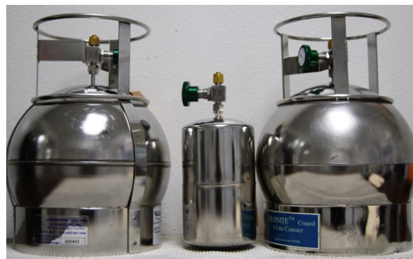
TO-15 SUMMA Sampling for VOCs